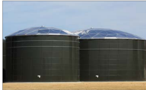
»» Epoxy Coated