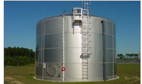
»» Stainless Steel